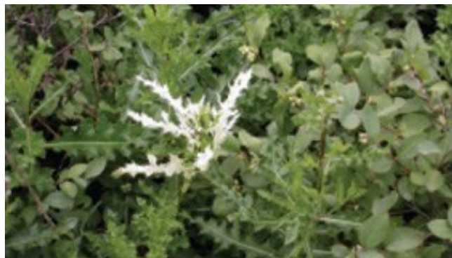
Phoma macrostoma attacking a weed in rangeland grass.