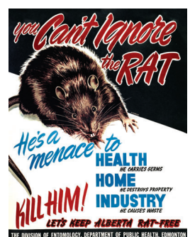
#11. Anti-rat poster