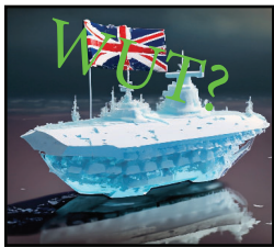
#4. AI render of an icy aircraft carrier