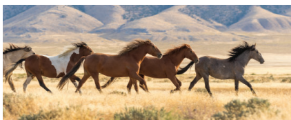
Herd of Wild Horses Running