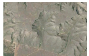
#3. The Badlands Guardian near Walsh, AB